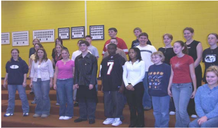
The 2003-2004 Chorale of Creston High School