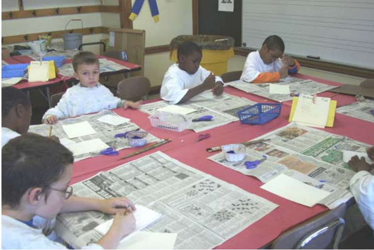
Second grade students going through the process of still life painting at Eastern elementary school.