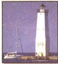
Frankfort North Breakwater