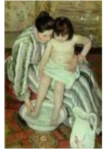
“La Toilette” c. 1891—oil on canvas, at The Art Insti-

Mary Cassatt was born in Allegheny City, Pennsylvania. She was the daughter of a prosperous business man, who believed that a good education included travel. By the time Mary was 10 years old, she was well acquainted with Paris, London, Berlin and much of Europe. Nevertheless, her father disagreed when her broad learning experiences inspired Mary to become a professional artist. She studied at the Pennsylvania Academy of the Fine Arts, but was impatient with the slow pace and the superior attitude of male students and instructors. Mary decided to study the masters on her own, and moved to Paris in 1866. She returned to the States at the onset of the Franco-Prussian War, but her father continued to be against her vocation. He generously provided for her basic needs, but refused to pay for art supplies. This obstacle, partnered with the reality that small-town America did not have the materials and models that she had grown accustomed to in Paris, caused Mary to return to Europe.