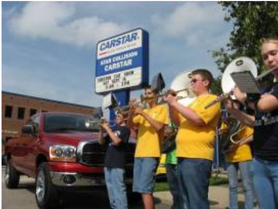
Creston High School Marching Band perform at the Creston Car Show.

Beautiful weather and spectacular cars were the backdrop for the latest performance by the Creston Band. The Creston Business Association sponsored the 2nd Annual Creston Car Show along Plainfield Avenue, where cars were on display in three locations. The band played selections from their 2006 field show and pep band tunes while the crowd took in the sites and sounds of the classic cars, hotrods, and exotics. The next performance for the Creston Band is the October 20th Homecoming game, followed by a performance on WZZM TV 13's "On Your Sidelines" high school football highlight show.