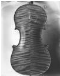
The Messiah Violin by Antonio Stradivari has never been played.

Although there are no birth records, Antonio Stradivari, better known by the Latin “Stradivarius,” is thought to have been born in 1644. Little is known about his youth, but Stradivari is considered the consummate violin craftsman. His hometown of Cremona, Italy is renowned for a rich history of violin makers. Stradivari himself was apprenticed to Niccolo Amati, who represented three generations of the craft. Antonio worked under Amati for more than 20 years. While best remembered for violins and cellos, Stradivari created many stringed instruments including, guitars, harps, lutes, and mandolins from the late 1600s to the early 1700s. Of the approximately 650 Stradivarius violins still in existence, many are still being played. The precise qualities of these masterpieces have never been duplicated making Stradivari’s creations the most valuable and sought after in the world.