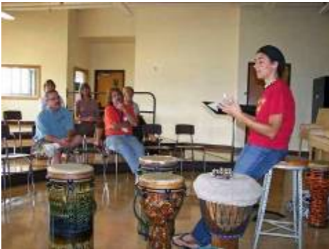
General music teachers march to the beat of a different drum during a drumming in-service.