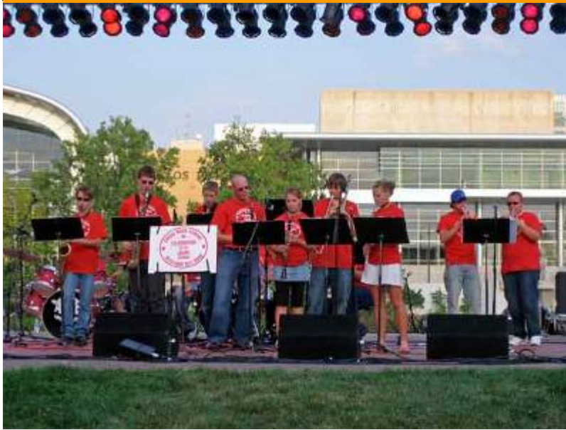
Union High School's Dixieland Jazz Band plays at Celebration on the Grand 2006 at